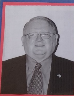
ART PEOPLES U.S. AIR FORCE