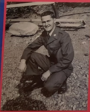
HARRY T. WILLIAMS U.S. AIR FORCE